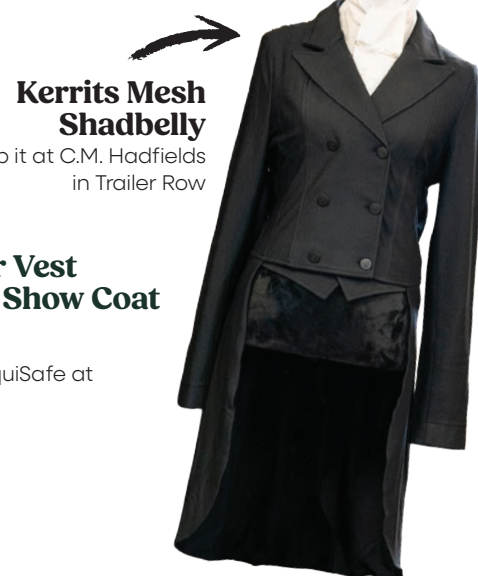
Kerrits Mesh Shadbelly

Shop it at Ride EquiSafe at Vendor Village