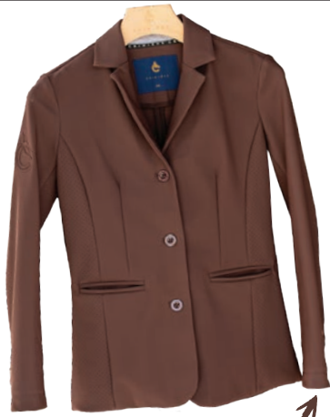
Crinière Alexandra Show Coat