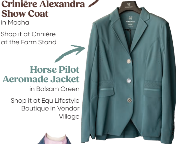
Horse Pilot Aeromade Jacket