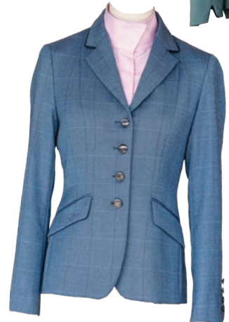
Custom Lillie by Flying Changes Show Coat

Shop it at The In Gate in Vendor Village