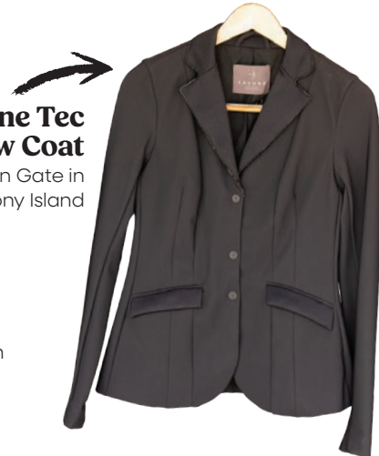
Laguso Jane Tec Show Coat