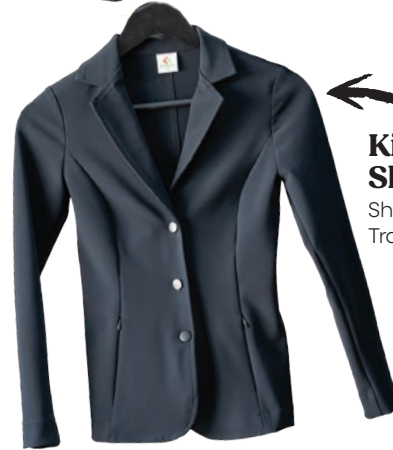
Kismet Sky Show Jacket

Shop it at The In Gate in Vendor Village