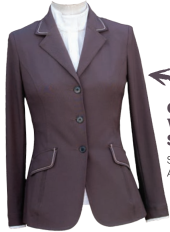
Charles Ancona Womens Classic Show Jacket

Shop it at Equ Lifestyle Boutique in Vendor Village