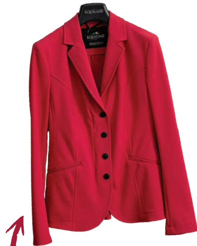
Equiline Cozy C Womens Competition Jacket

Shop it at C.M. Hadfields in Trailer Row