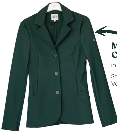
Madama Air Vest Compatible Show Coat