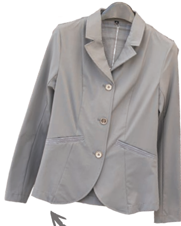
70 Degrees Lumiere Show Coat