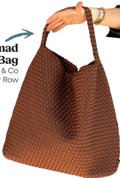
Naghedi Nomad Hobo Bag Shop it at Turner & Co on Trailer Row