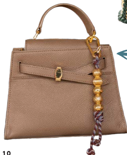
Veronica Beard Dash Top Handle Bag Shop it at Odette in Vendor Village