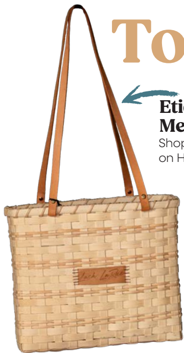
Etiquette Messenger Bag Shop it at Lash LaRue on Hunter Hill