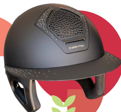
FreeJump Voronoi Carbon Shop it at Ride EquiSafe in Vendor Village