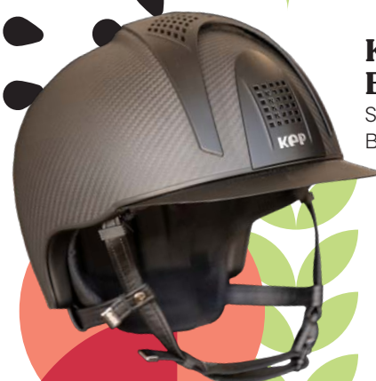
KEP Carbon Elite Matte Shop it at Equ Lifestyle Boutique in Vendor Village