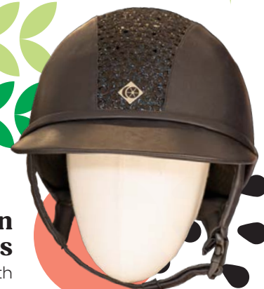
Charles Owen SP8 Plus Custom Leather look with Sparkle Center Shop it at The In Gate in Vendor Village and Pony Island