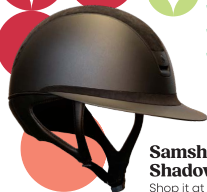
Samshield Miss Shadow Alcantera Shop it at Running Fox in Trailer Row