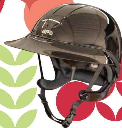
GPA Star Lady Glossy Shop it at Miki Saddlery in Vendor Village