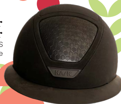
Kask Star Lady Hunter Shop it at EQUIS in Vendor Village