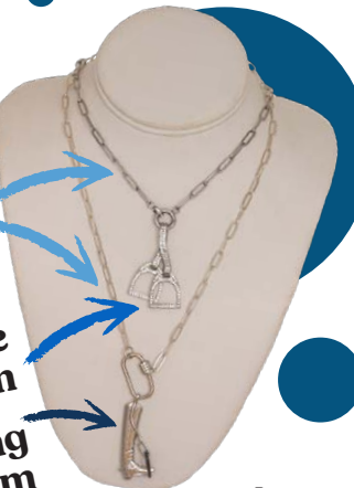
Lexington Carabiner Necklaces