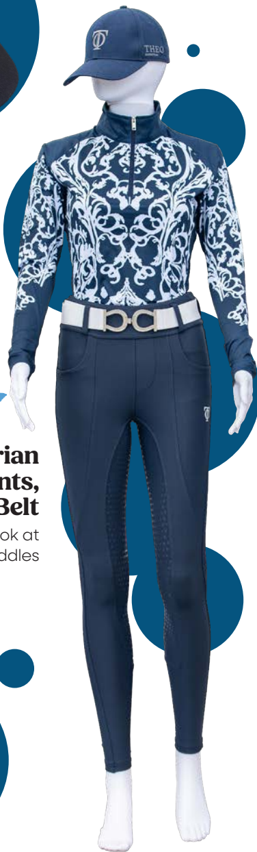
Theo Equestrian Top, Pants, and Belt