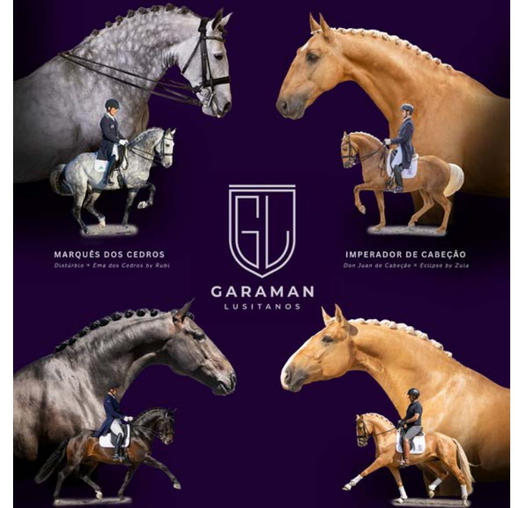
MARQUÊS DOS CEDROS Distúrbio • Ema dos Cedros by Rubi