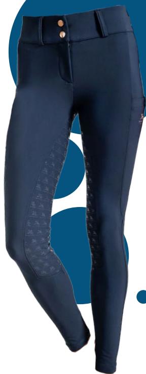
Dressage Training Breeches