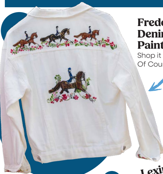
Frederique Denim Hand Painted Jacket Shop it at The Horse Of Course