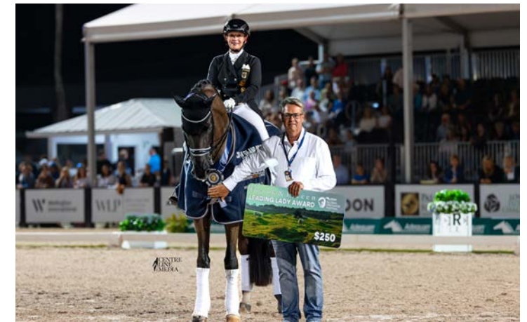
Isabell Werth earned AGDF 7's Leading Lady Freestyle Rider Award, sponsored by Frank & Eileen .