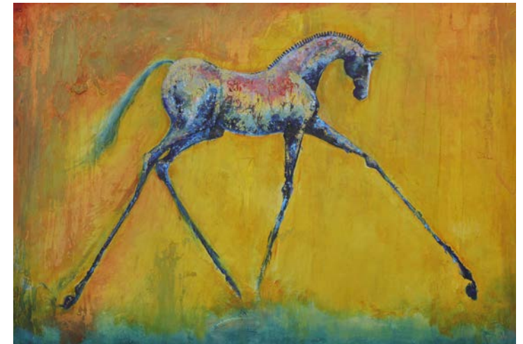
PICTURED LEFT: WILD AT HEART PICTURED RIGHT: POETIC MOVES

used to achieve hyper texture and are inspired by a true passion for process in both painting and horse training. Glazing, layering, and thinned paint along with the use of brushes, pallet