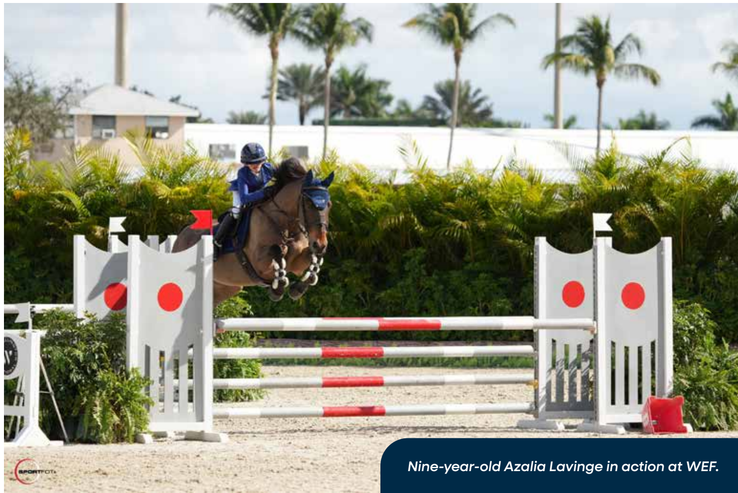
Nine-year-old Azalia Lavinge in action at WEF.