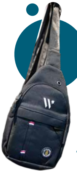
Crossbody Bag Shop it at Wellington International Shop at Bridge Deck Shops