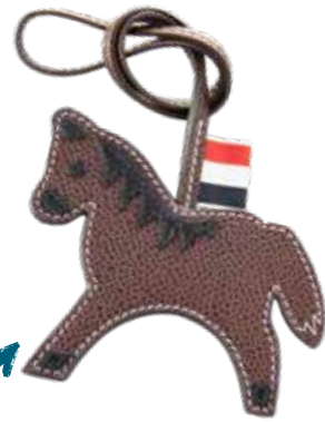
Thom Browne Horse Charm Shop it at Serenella at Tiki Terrace