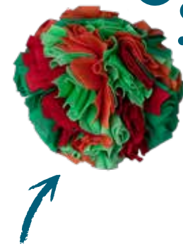
Fluff Monkey in the color Poppies Shop them at Equestrian Team Apparel in Vendor Village