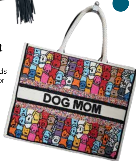
Beaded Dog Mom Tote Bag Shop it at Fab Finds By Sarah in Vendor Village