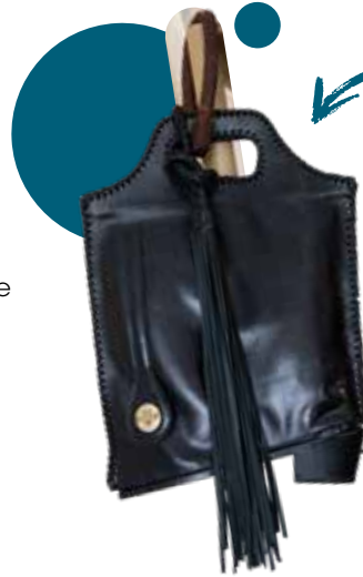
Fringe Boot Bag Shop it at Odette in Vendor Village.