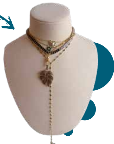
Eye-Catching Emerald Neck Party Collection Shop it at La Envosé Designs in Vendor Village